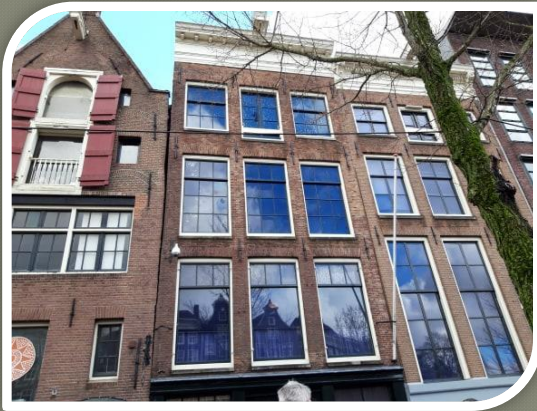
Casa di Anna Frank

In summer the Frank family moves to Holland. Anna and her sister study in a Jewish school, while their father works in a company.