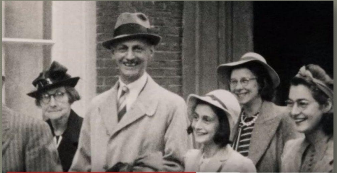
La famiglia Frank, https://www.repubblica.it/cultura/2018/01/24/foto/otto_frank_e_le_foto_della_tragedia_della_famiglia_di_anne-187186080/1/

Her family is composed by her father Otto, her mother Edith and her older sister Margot.