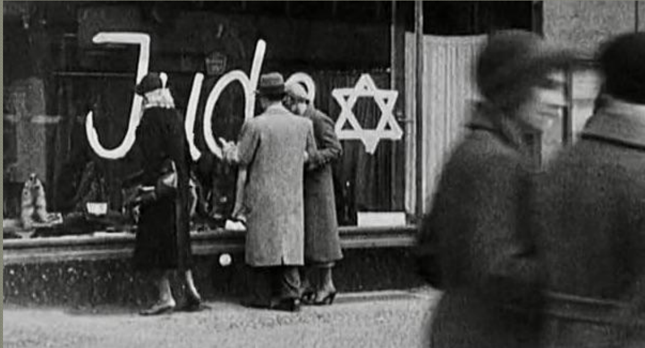
La notte dei cristalli,

https://www.iltrentinonuovo.it/index.php/2022/02/20/17-la-notte-dei-cristalli-e-le-leggi-razziali/