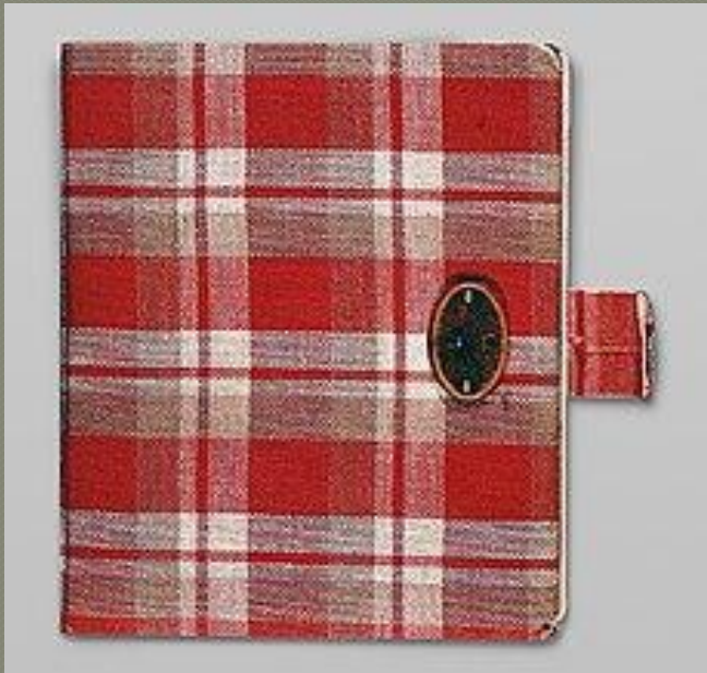
Il diario di Anna Frank, https://pt.wikipedia.org/wiki/Di%C3%A1rio_de_Anne_Frank

In 1940 Germans arrive in Holland and the Frank family hides with other people in the Achterhuis.