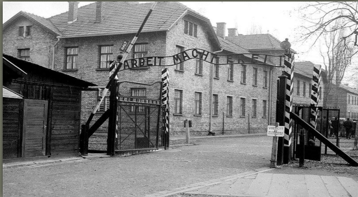
Campo di concentramento, https://www.storicang.it/a/anna-frank-ragazza-che-sognava-di-diventare-scrittrice_14879

In this diary she writes about her feelings, her story and her daily routines until 1st August 1944, when Germans find their shelter. The Frank family is deported to concentration camps.